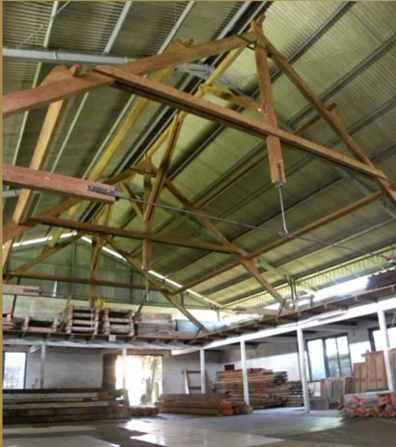
Ready to view in our Bali warehouse.

A single story open roof plan is possible as well as a two story structure. One of the most versatile configurations would be a partial open roof plan with a loft / mezzanine. It can be re-constructed with or without in filled walls or with some sides enclosed and others left open. It would be a magnificent private Vila or a commercial building such as a restaurant, or a hotel / resort anchor reception area.