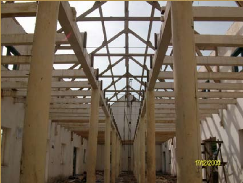
During disassembly and before restoration.

This stunning 2 story building, 12 meters wide, 45 meters long and 8 meters to the ridge, is constructed entirely of the best quality Javanese Teak available at the time. It is all dense, old growth wood with almost no sapwood and few knots. The largest beams, the mezzanine girders, measure an amazing 18 cm x 28 cm x 540 cm long. It features beautifully turned support posts 25 cm in diameter, spectacular trusses with hand forged steel fittings, two spectacular massive staircases and solid teak doors and windows crafted for strength, utility and aesthetics.