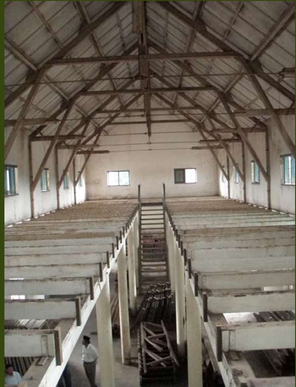
During disassembly and before restoration.