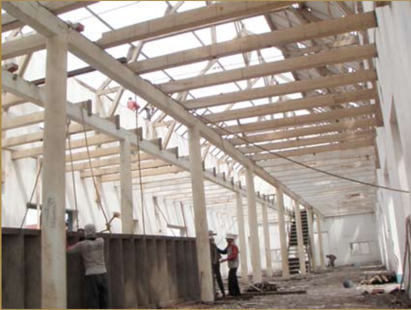
During disassembly and before restoration.

In late 2009, we carefully dismantled the entire building by hand and transported to our warehouse on Bali.